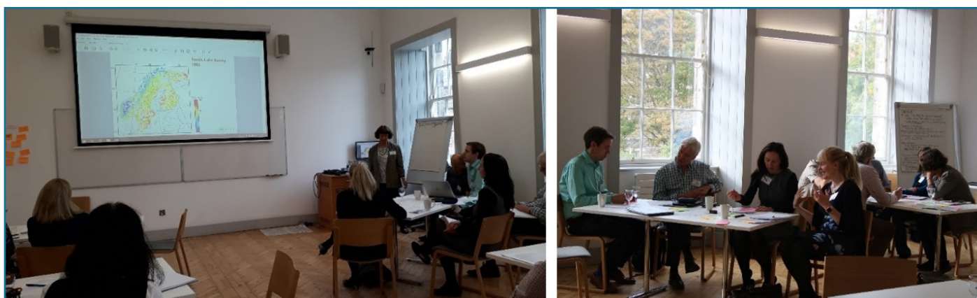
Figure 3: Photo of Workshop event; Sept 2018