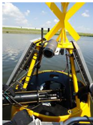
Figure 1 Continuous sensing in the Netherlands